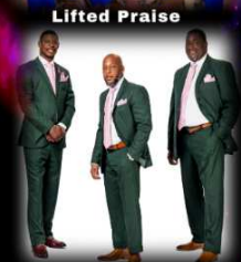
Fountain City Spiritualaires