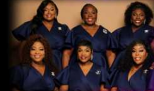
The Caldwell Singers