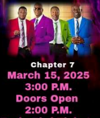
Chapter 7 March 15, 2025 3:00 P.M. Doors Open 2:00 P.M.